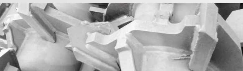
Shredding unit - multifunctional