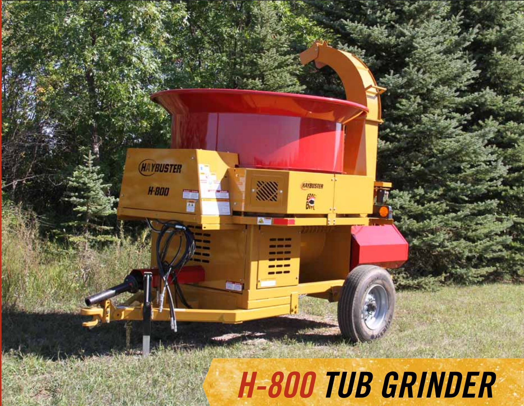
H-800 TUB GRINDER